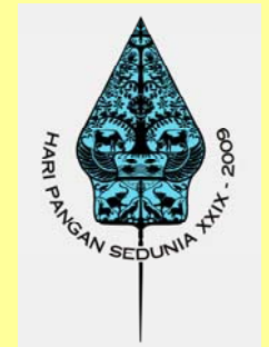
Figure 2. National Logo

The national logo for 2009 WFD has been adopted from a symbol used in traditional puppet of Javanese tradition, known as "Gunungan Wayang Purwa". The logo symbolizes the universe containing various sources of foods for ensuring food security of human beings. The logo describes both animal and plant sources of food, covering food crops (rice, maize and tubers), animal source foods (beef and fish), fruits and vegetables.